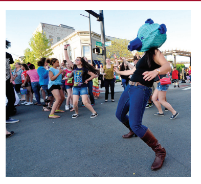
BUW has been at every Third Thursday, and the Pittsfield Prevention Partnership engaged youth in the Harlem Shake in May, 2013.

Our YOU First Day of Caring , focused on middle school youth and career planning, took place at five locations across the county in September, 2012.